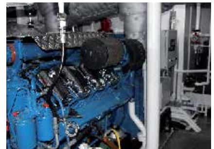
The Scania diesel generators can power the tug during transit and light towing.