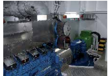
One of the Mitsubishi main engines with the Veth azimuth thruster and the permanent magnet shaft motor/generator. The main engines are used for heavy towing only.

Using only electric propulsion, the ship can travel at 10 knots (18.5 km/h), when combined with the main diesel engines the maximum speed increases to 13.5 knots (25 km/h). When running in electric mode, the vessel saves significantly on fuel costs. However, because the tug often requires peak power suddenly, the main engines are always ready on standby to supply power.