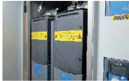
The towing winch (left) and the VACON® NXP drives for the towing winch (right)