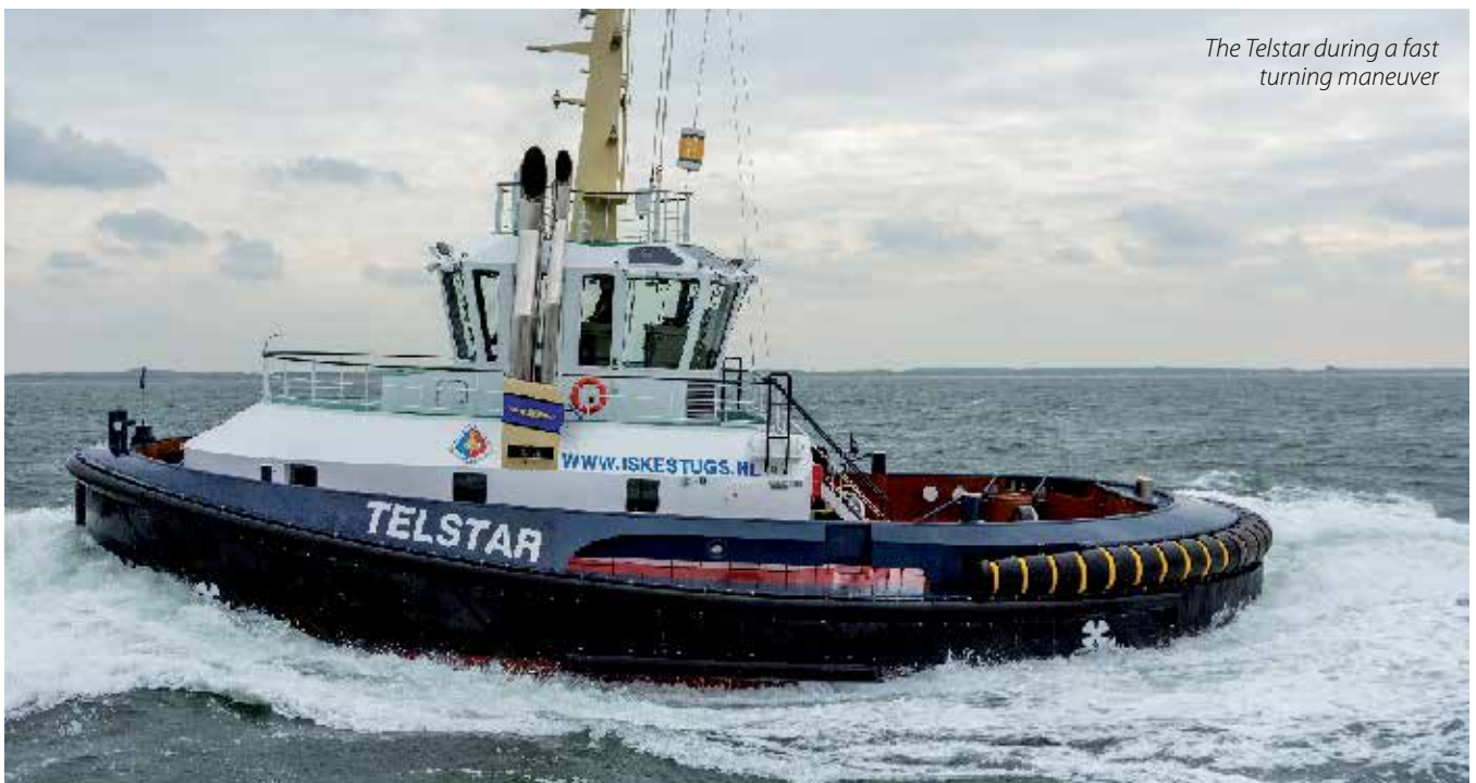
The Telstar during a fast turning maneuver

Length over all: 25.45 m Length Loadline: 23.53 m Length on waterline: 24.18 m Beam over all: 12.20 m Beam moulded: 11.40 m Depth to maindeck: 7.01 m Operational draught: approximately 5.65 m